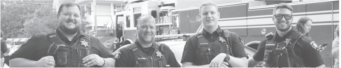
Lewisville's Finest at National Night Out 2025

6510 Shallowford Road, P.O. Box 547, Lewisville, NC 27023-0547 Ph. 336-945-5558