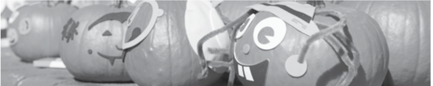
Shalloween Pumpkins 2024

6510 Shallowford Road, P.O. Box 547, Lewisville, NC 27023-0547 Ph. 336-945-5558