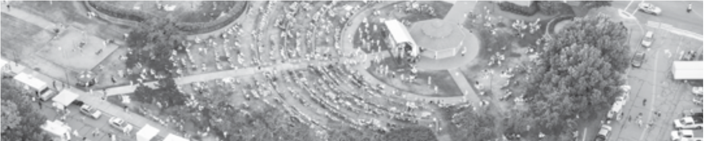
Street Party & Food Truck Festival 2024

6510 Shallowford Road, P.O. Box 547, Lewisville, NC 27023-0547 Ph. 336-945-5558