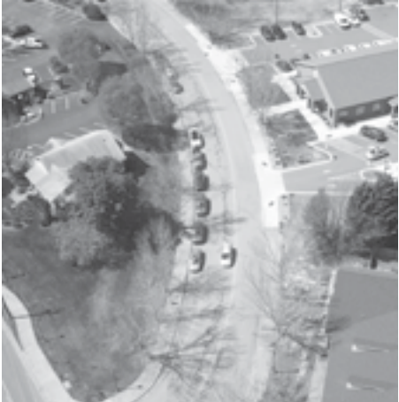
Image of current Great Wagon Road near the Post Office, courtesy of the Lewisville Fire Department

This project is expected to be completed by March of 2029.